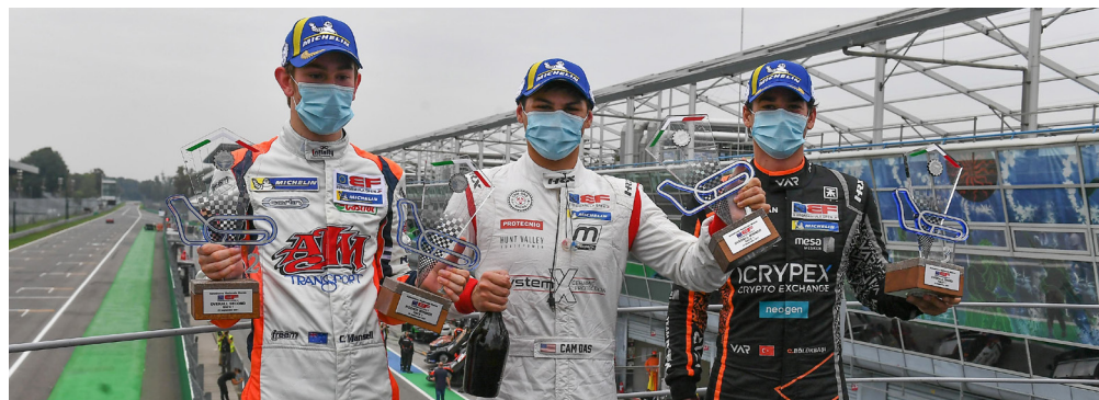
Monza podium finisher Mansell (l) steps up for a full-time Euroformula effort in 2022