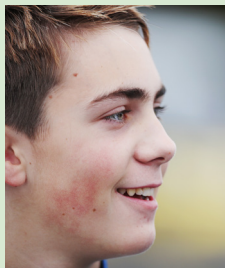
Pearson: first in