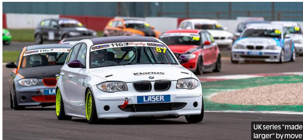
UK series "made larger" by move